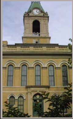
Robertson County Courthouse