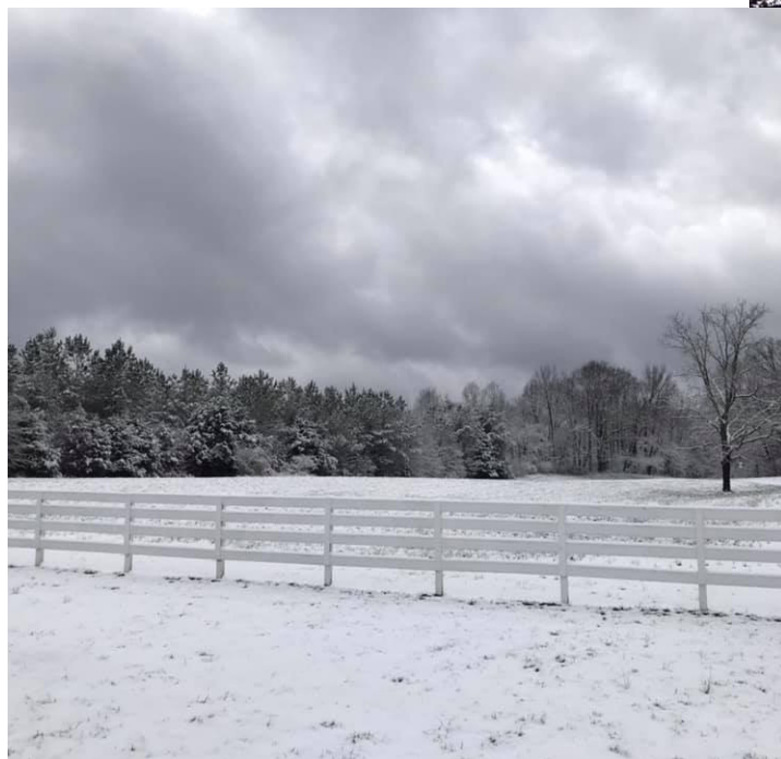
Putnam County Snow