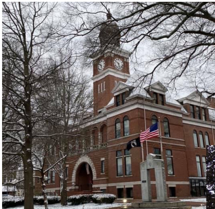
Henry County Courthouse

Check out these beautiful photos shot by your colleagues around the state!